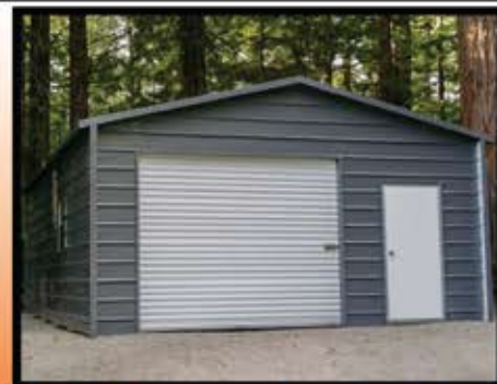
12' x 20' x 5' - Classical Style